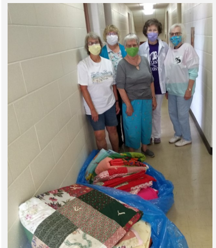
Quilts donated for Afghan refugees