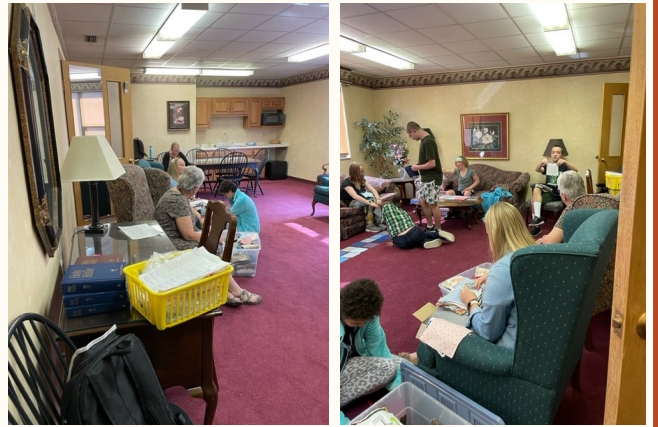
Syble Hopp students who helped with quilting during the 2021-2022 school year.