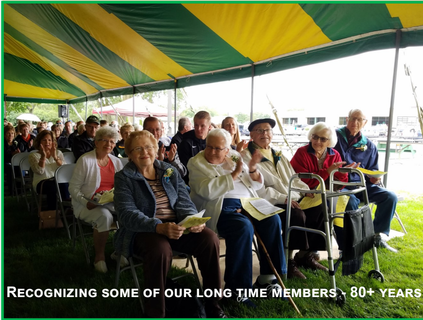
RECOGNIZING SOME OF OUR LONG TIME MEMBERS - 80+ YEARS

Thank you all for making this an awesome event!